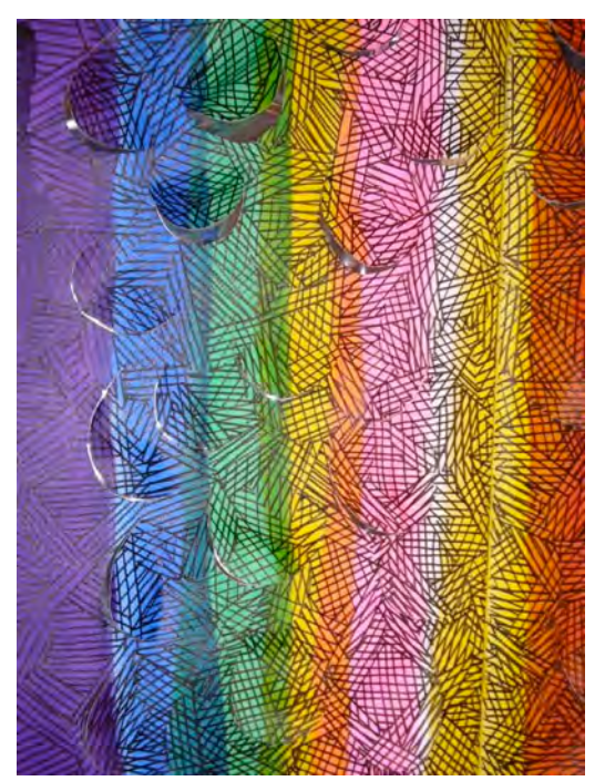
Jason Yates' "School Clown"

ooo/ ivieliuse Averlue, Suite B2/4 West Hollywood, CA 90069 MAP